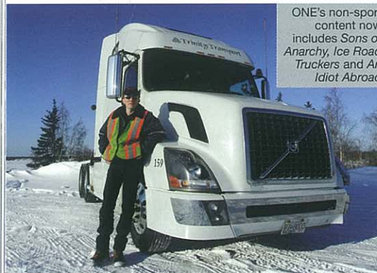
ONE's non-sport content now includes Sons of Anarchy , Ice Road Truckers and An Idiot Abroad